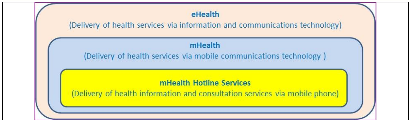
Figure 1. Interrelationship Among eHealth, mHealth, and mHealth Hotline Services